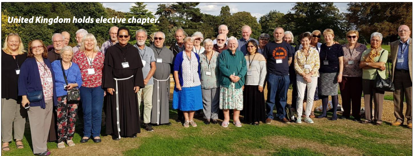
United Kingdom holds elective chapter.

canonical establishment and elective chapter.