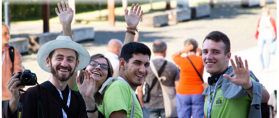
Some more Congress pilgrims.

The results of the social initiative, “Well4Africa,” showed that the European fraternities raised 51,000 Euros. The fundraising will continue and the implementation of the projects – to drill wells for water in drought areas of Africa – was to start after the Congress.