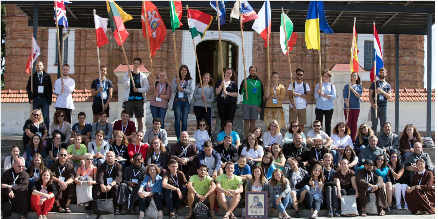
Many Congress delegates, replete with Franciscan youth, gather for group photo.