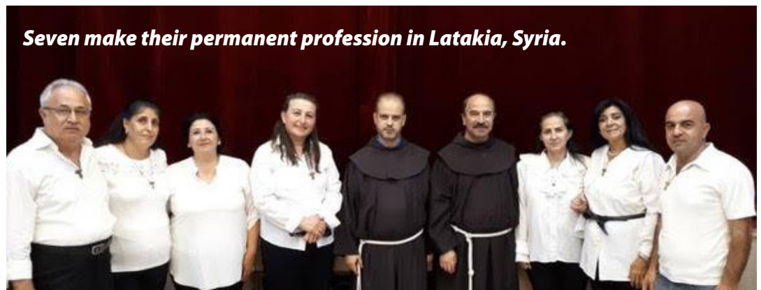
Seven make their permanent profession in Latakia, Syria.