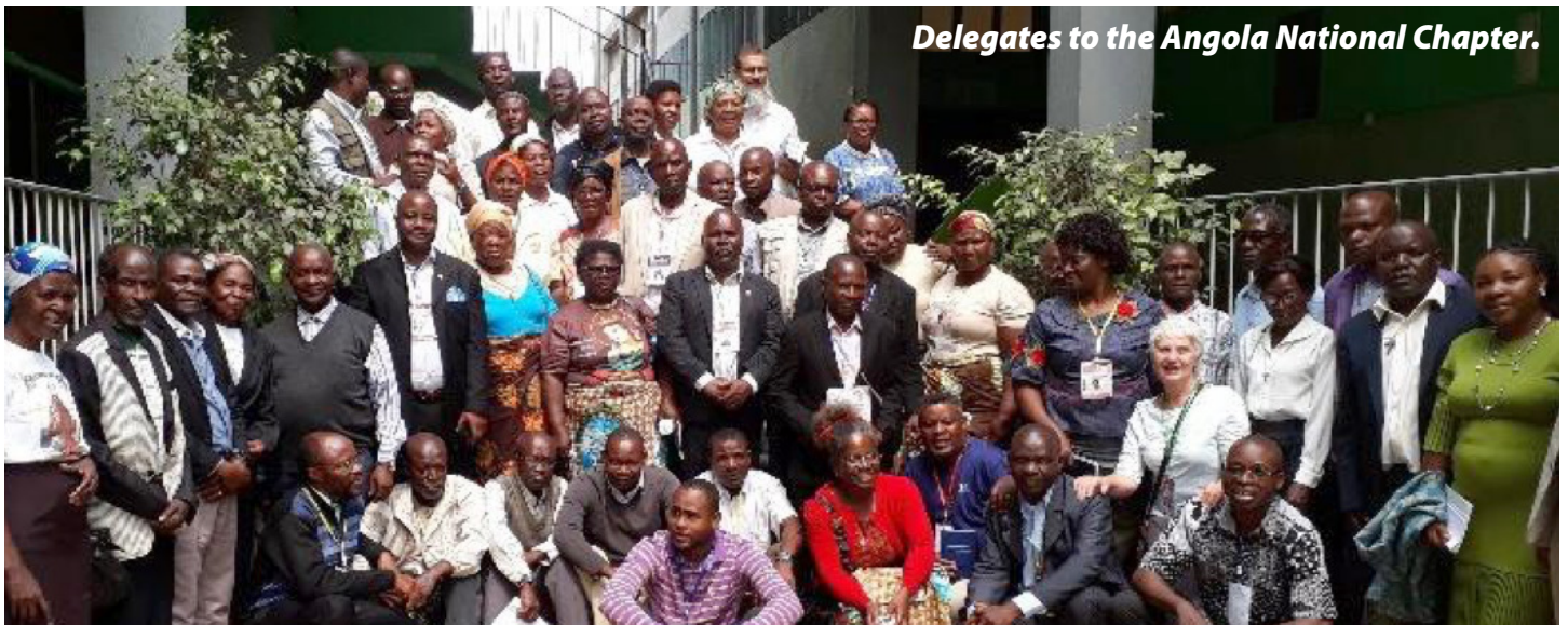
Delegates to the Angola National Chapter.